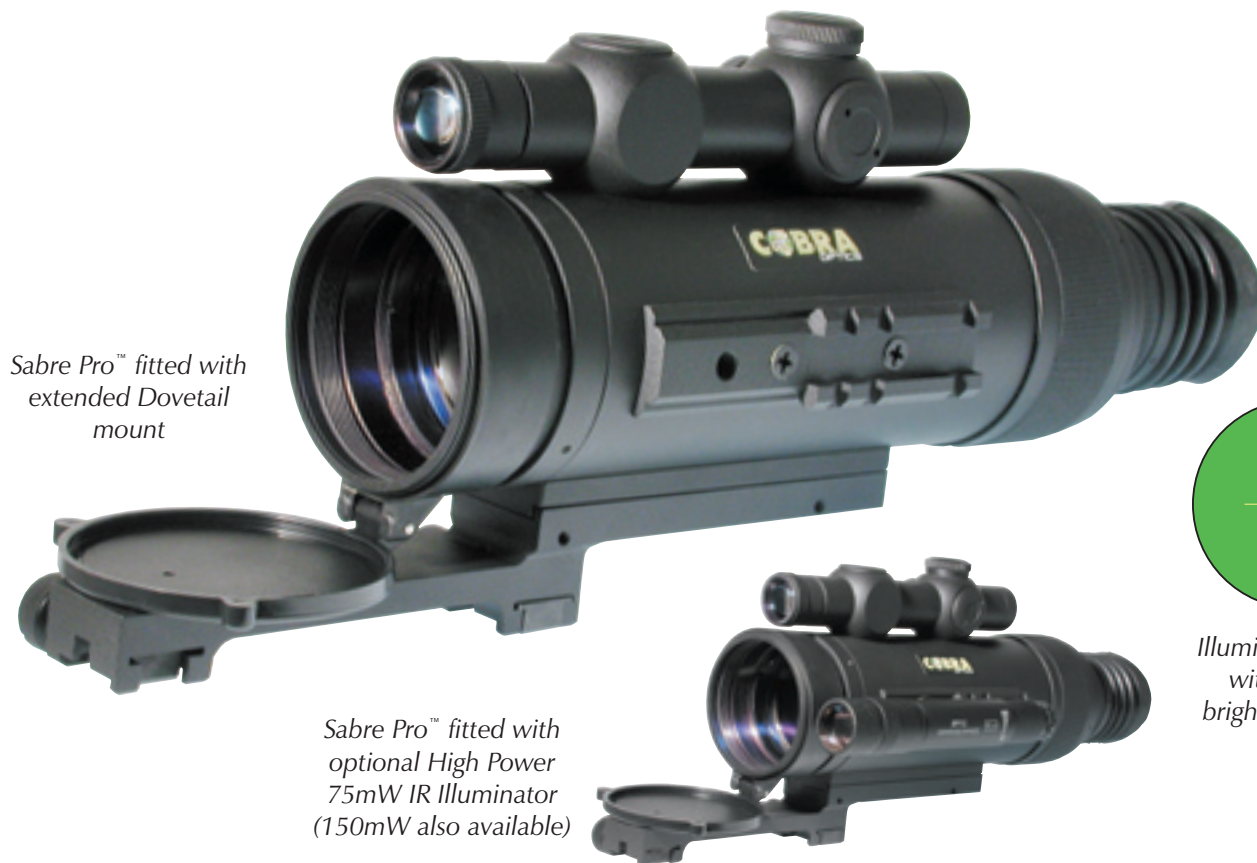
Sabre Pro™ fitted with extended Dovetail mount